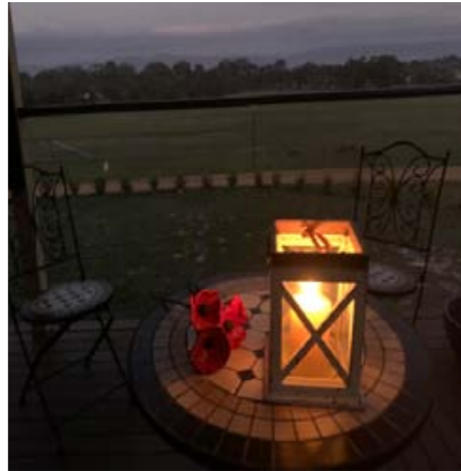
Dawn on Anzac Day

This is a very different world today even compared to just six weeks ago. As we pay homage to the ANZAC this week, and the many service personnel from Australia and New Zealand who have served or continue to serve, we recall their sacrifice for others. We may not stand together this year at the services in Stawell and Ararat, but we join together in spirit from our driveways and verandahs. Lest we forget!