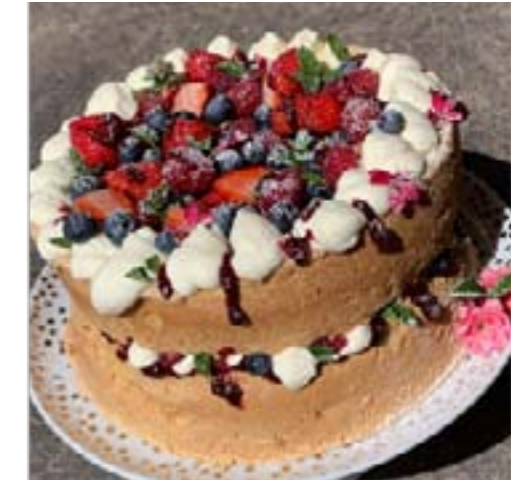
Emily Manning Year 11 Food Studies.

Congratulations to the many students who have demonstrated great innovation and creativity in their learning at this time. Each day online, we have been witnessed to some wonderful examples of new ways of learning.